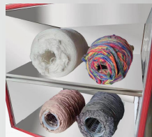
Open door picture