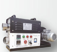
Hot-Air Generator HG