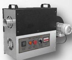
Hot-Air Generator HG