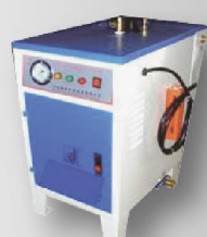
Steam Generator SG