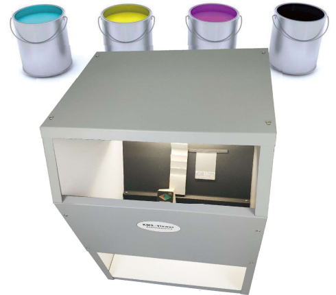
对色 Color Matching