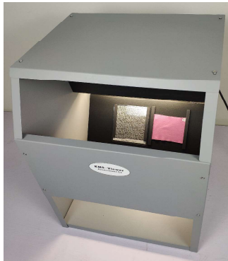
起毛起球评级 Pilling Assessment