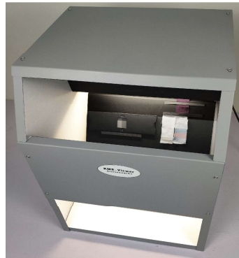
沾色变色评级 Grey Scale Assessment