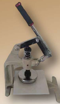
Model: HSP cutter

ASTM D2646、D3776、BS 2471、3424、 BS EN 12127、GB 4669、ISO 3801、 IWS TM 13、JIS L10181、L1096、M&S P65、P64A