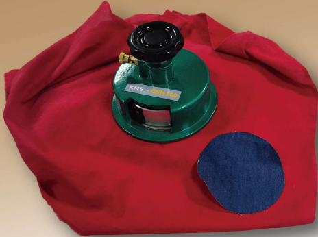
Model: Circular Cutter GSM-100