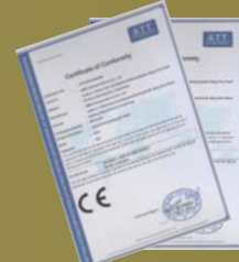
CE EU Certificate