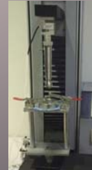
Ball bursting grip