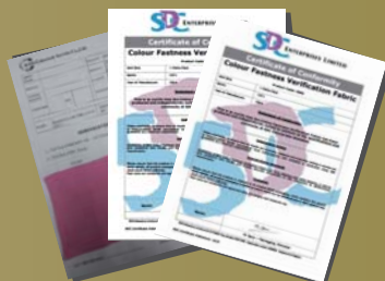
SDC VF Certificate