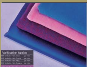
SDC VF Verification fabric